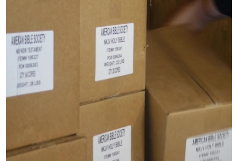
Bibles awaiting distribution to the Jail