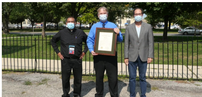
The Year of the Chaplain

The Pandemic has put first responders and front line workers in the spot light. One group of front line workers who have not received as much notice by the press are the chaplains. Working in our hospitals, jails, and other institutions, they represent the Bible cause in so many different situations. Whether the sick in