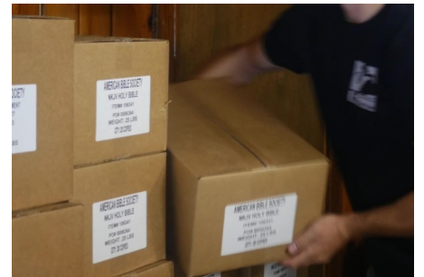
Bibles arrive at the county jail for distribution

Using inaccurate or prejudiced stereotypes, some would say that providing Bibles is a wasteful expense. We strongly disagree. Many do not have smart phones or other devices that allow easy access. Certainly, those behind bars cannot ac-