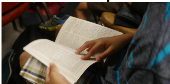
A teen discovering the Bible at Youth Collision

In a world where most people have ready access to the Bible, our primary mission is to help people engage with and understand the Bible. We believe that the Bible changes lives. The change happens as we read the Scripture and attend to