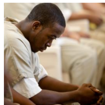
Jail can be a lonely time of searching

We are also thankful for the contributions of our