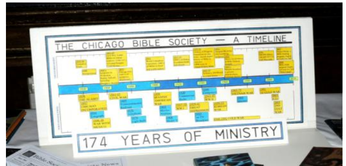
A timeline of CBS ministry since 1840

The largest part of our work, however, is programs that encourage people to read and understand the Bible. We do this through Project Philip, through our children's literacy project and through partnerships with 39 urban ministries and churches.