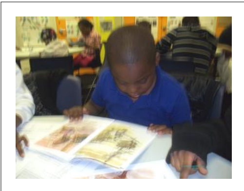
1st-Grader improving his reading skills using the Mission:Literacy reading program.

ing project use the program. The results were impressive: a 35% decrease in kids reading below grade and a 250%