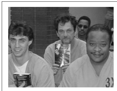
Inmates studying the Bible at Project Philip in Chicago