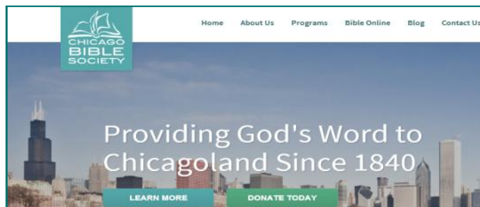
New website at ChicagoBibleSociety.org shows CBS's new look

The Urban Children's Literacy Program continues its growth. We have now moved from being a pilot project – reaching 25 children – to a city-wide effort in Cabrini-Green, Austin and Englewood reaching more than 200 school children in some of Chicago's toughest neighborhoods.