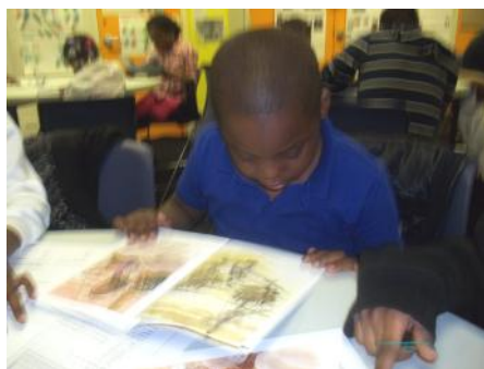
1st-Grader improving his reading skills using the Mission:Literacy reading program.

They have reached thousands of people who come to pray and hear about Jesus.