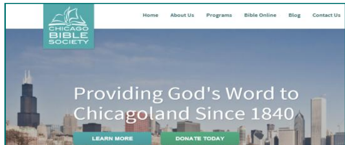
CBS reaches Chicago online as well as directly touching hundreds of lives through our engagement partnerships.

Project Philip is our Bible engagement program at Cook County Jail. Inmates enroll in a small group Bible study that allows them to study the Bible and in-